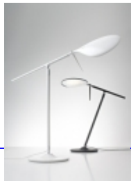
F11 Paddle B01 01